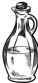
Milk, Water & Oil

1 cup = 227 g 1/2 cup = 113 g 1/3 cup = 75 g 1/4 cup = 57 g 1 tbsp = 12 g